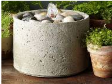
smallest is this Pebble Fountain.

It is a universally accepted fact that water features add needed and desired ambiance to a garden area. The sight of moving water is visually interesting and soothing; the sound of trickling water is also soothing, changing the mood of a garden from ordinary to perfection. A fountain is an easy way to add that ambiance. Fill it with water and plug it in. No water source needed, just a grounded plug.