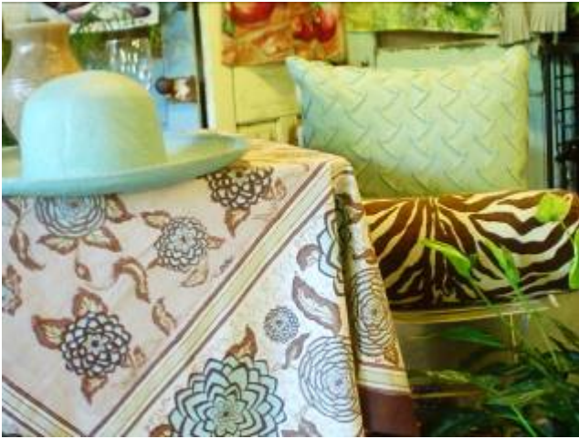
New Accessories for Fall!

Wilshire Garden Market 2821 West Wilshire Boulevard Oklahoma City, OK 73116